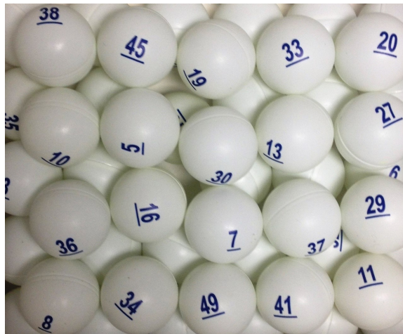
Calcutta Sep. 30th 5pm Upstairs at the Legion