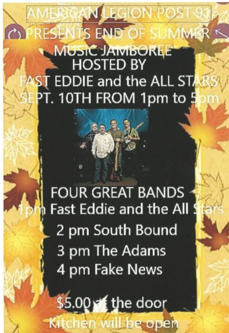
4 Band Jamboree Sep. 10th 1-5pm